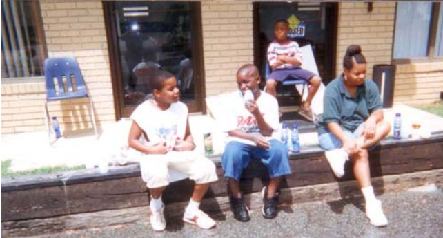
Taking a Walk Down Memory Lane... 2000 Fund Raiser Car Wash for a trip to Wild Adventures!