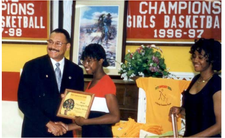
Taking a Walk Down Memory Lane... In 1999 YES Participants receives awards from Congressman Sanford Bishop as their families and friends beamed with PRIDE.