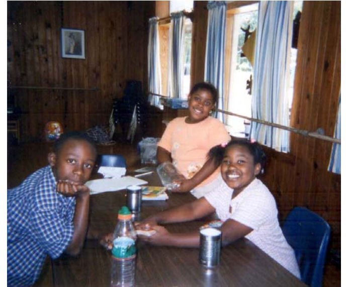
PAST PARTICIPANTS & PEER COUNSELORS